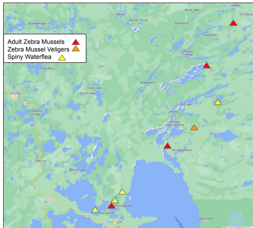
Water bodies invaded by zebra mussels and spiny waterflea

More results will be shared as they become available.